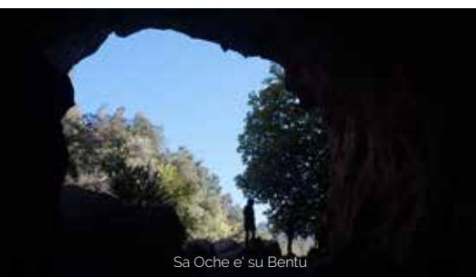
Sa Oche e' su Bentu

Lanaittu. Exploring this area you have the feeling that time has stood still for thousands of years. It's a magical place where we visit the water temple of the Nuragic People, the "Eye of the wind" cave (Sa Oche e Su Bentu), the Corbeddu cave where they found human remains dating back 25,600 years and which was once the shelter of the most infamous bandits. On the way back we take a short walk to visit the deepest natural water source in the Island.