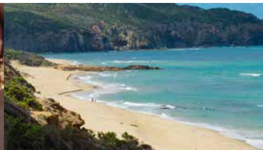
Impressions of the south west