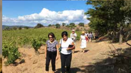
Museum of the mask and wine tasting

If then there is some time left we go to the charming medieval town of Galtelli, where we drive up to the top of the mountain to visit the big bronze statue of Jesus on a cross 12 meters high. The panorama from there is breathtaking. A view over the Gulf of Orosei and the mountains above Lula and the Supramonte.