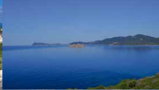
Photos of the south west coast