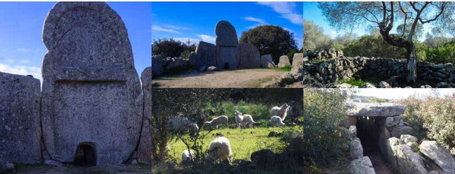
Photos of San Sperate

After our breakfast, we load our luggage into the car and we are then ready to drive down to the Giants' Tomb S'Ena e' Thomes" (1800-1600 BCE:). Then we drive back to Cagliari and on our way we stop at the Nuragic fortress Nuraghe Losa. This building is unbelievable and it will be your