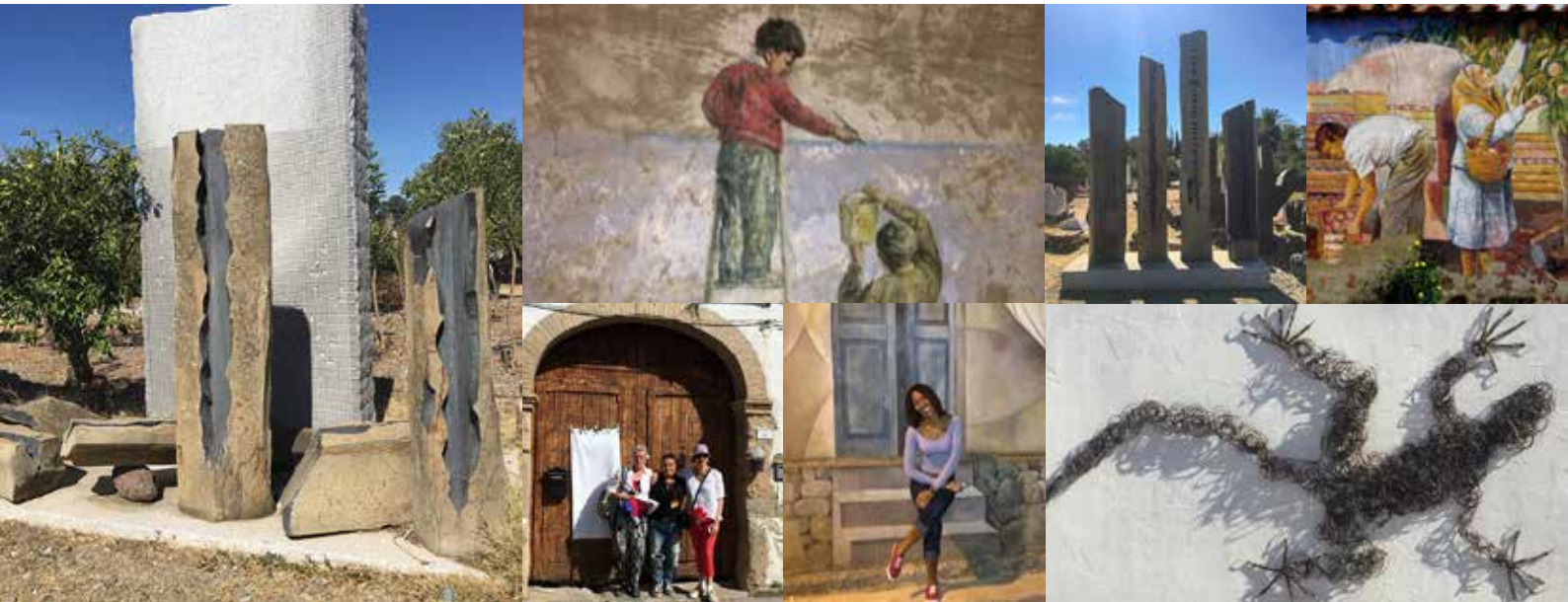
Photos of San Sperate