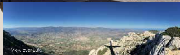
View over Lula