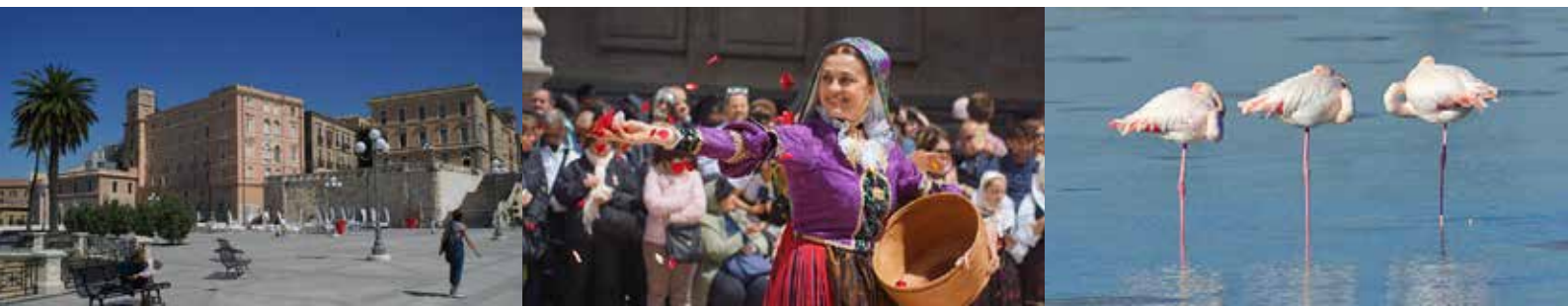
Photos of Cagliari

We will pick you up at Cagliari Airport and take you to your accommodation. In the evening, you can join us at the welcome dinner where you meet our team as well the other participants.