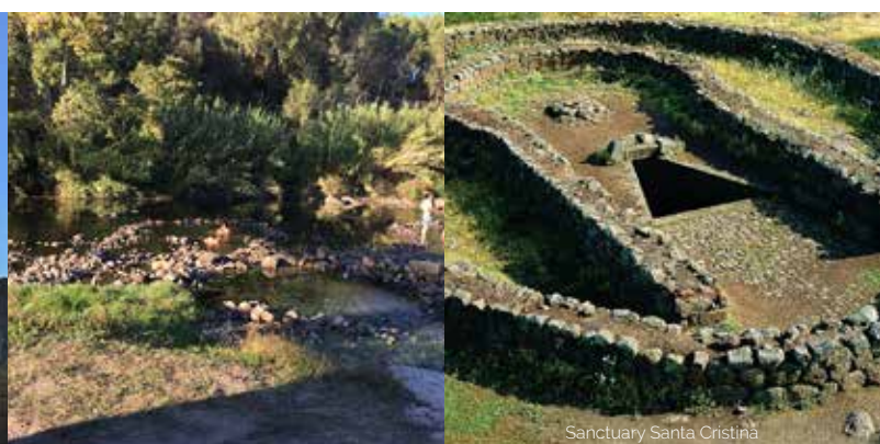
Sanctuary Santa Cristina