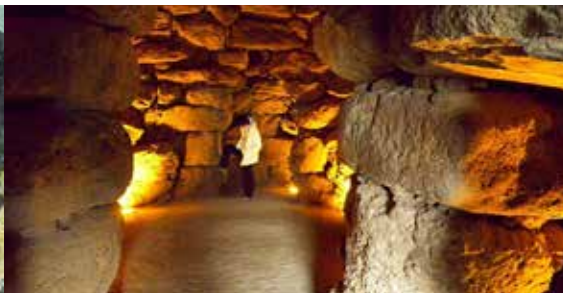
Nuraghe Losa 1200 B.c