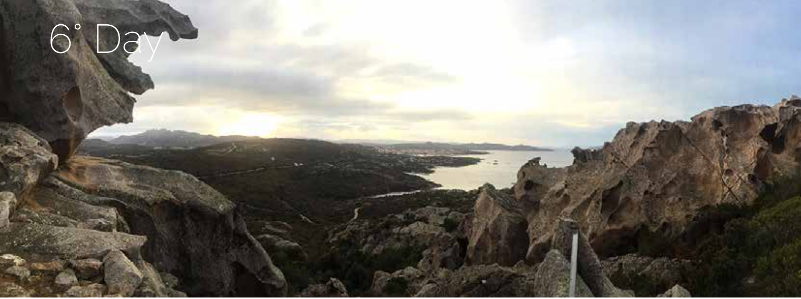
Photo over Palau