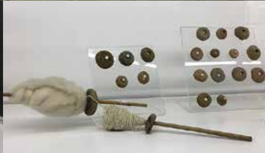
Photos of the Mueseum