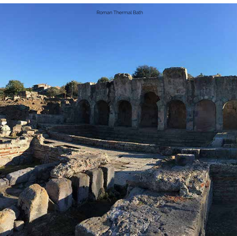
Roman Thermal Bath

We then drive on towards the center of the Island. On the way we have two choices: we can stop at the Roman thermal baths where you can relax in the natural pools on the river, or we can visit the amazing 'Holy well sanctuary called the 'Pozzo di Santa Christina', built around 1100 BCE. Later on we drive through the charming mountains of Oliena to the Hotel, the 'Rifugio di Su Gorropu'. It's a charming place in the middle of the mountains with an incredible view over the canyon and the mountains. The local food is of the highest quality and is all homemade. This is your chance to experience the real Sardinia. The oldest family of the world lives in these mountains and there is the highest concentration of people over one hundred years old in Europe.